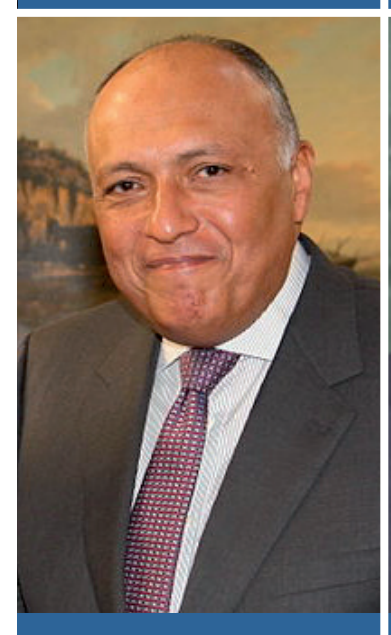
SAMEH HASSAN SHOUKRY Minister of Foreign Affairs, Egypt