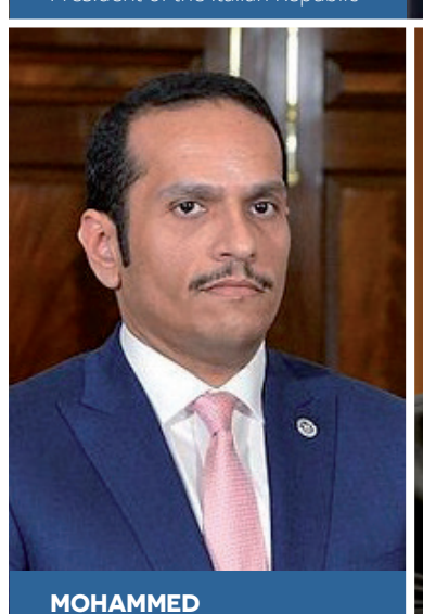
BIN ABDULRAHMAN BIN JASSIM AL-THANI Deputy Prime Minister and Minister of Foreign Affair