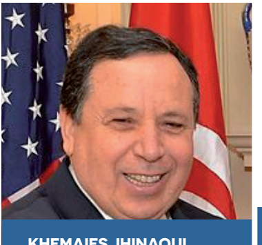
KHEMAIES JHINAOUI Minister of Foreign Affairs, Tunisia