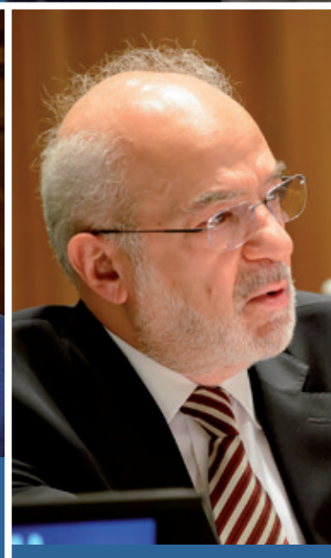
IBRAHIM AL-JAFAARI Minister of Foreign Affairs, Iraq