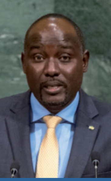
IBRAHIM YACOUBOU Minister of Foreign Affairs, Niger