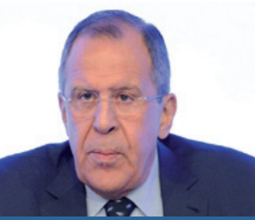
SERGEJ LAVROV Minister of Foreign Affairs, Russia