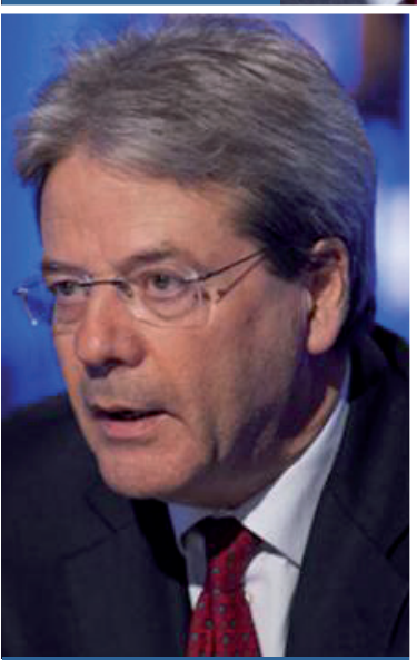
PAOLO GENTILONI President of the Council of Ministers, Italy