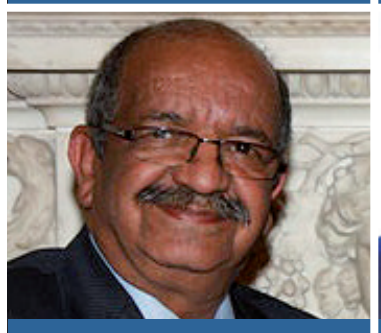
ABDELKADER MESSAHEL Minister of Foreign Affairs, Algeria