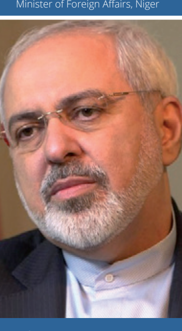
MOHAMMED JAVAD ZARIF Minister of Foreign Affairs, Iran