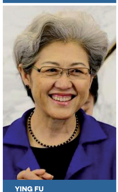
Chairperson of the Foreign Affairs Committee, National People's Congress, China